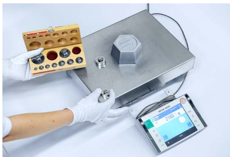
Calibration of the used balances

The most common procedure for manufacturing of high precision calibration gas mixtures is the gravimetric