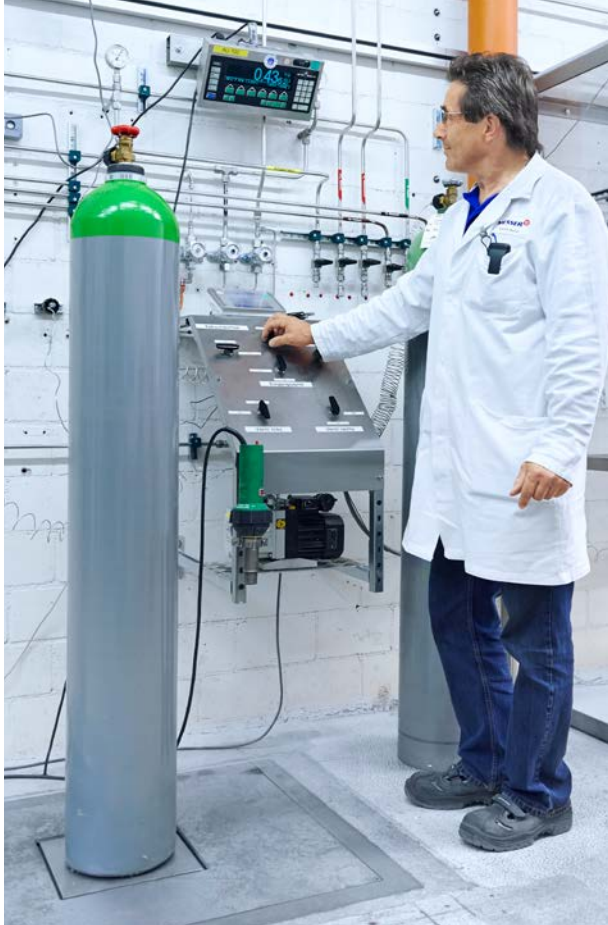
Gravimetric production of gas mixtures

method according to ISO 6142 (Gas analysis – Preparation of calibration gas mixtures – Gravimetric method). This method is based on weighing the masses of the particular components. Weighing is one of the most accurate physical measuring methods, which is why the gravimetric preparation is employed to manufacture high precision calibration gas mixtures.